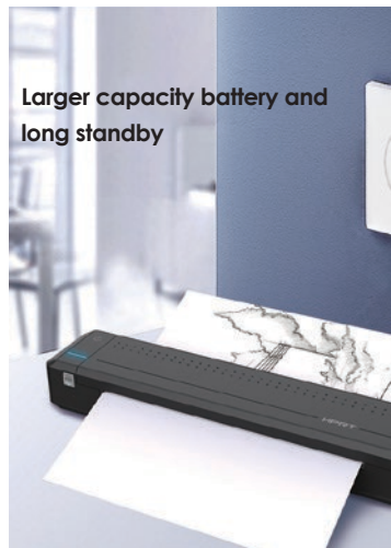
Larger capacity battery and long standby

Equipped with dual mode Bluetooth and USB TYPE-C interfaces. Choosing the connection you want based on you usage