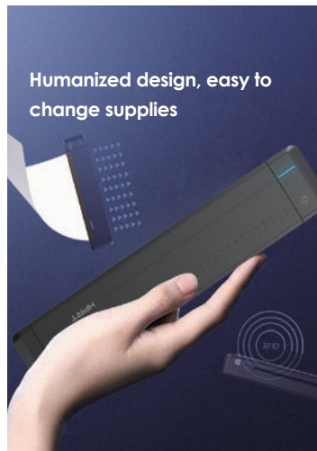
Humanized design, easy to change supplies