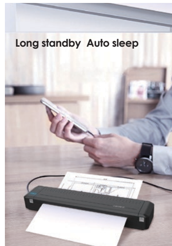
Long standby Auto sleep